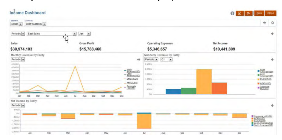
Figure 1. Configurable dashboards make it easy to quickly visualize data in real-time

Oracle Financial Consolidation and Close Cloud Service is a solution that can be configured to fit individual organizations' requirements. Using best practices, coupled with pre-seeded content the system allows organizations to build an application that meets their business needs without having extraneous functionality that are not required. It enables organizations to combine a world class consolidation solution with the ability to tailor the solution for the features they require.