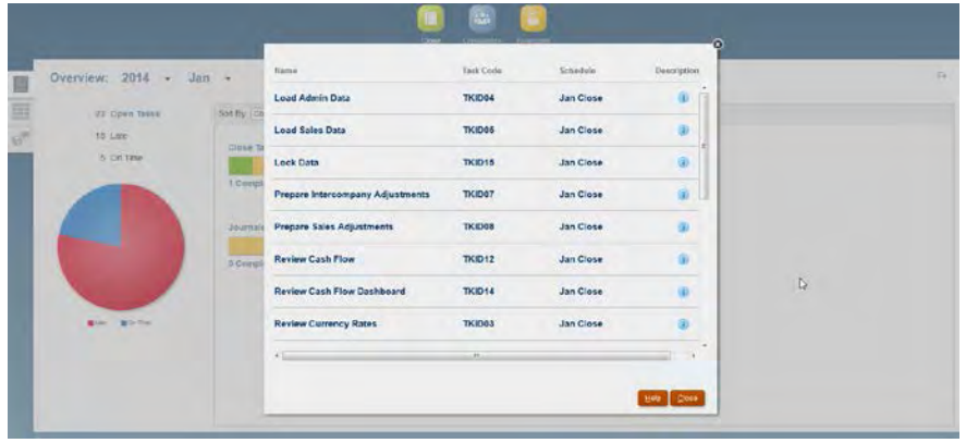
Figure 3. Manage the entire close process